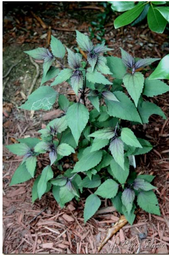
Eupatorium 'Chocolate' Snake Root is growing well and I love the foliage on it. It looks like a leaf miner is liking the leaves too.