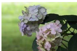
Forever Dwarf Hydrangea