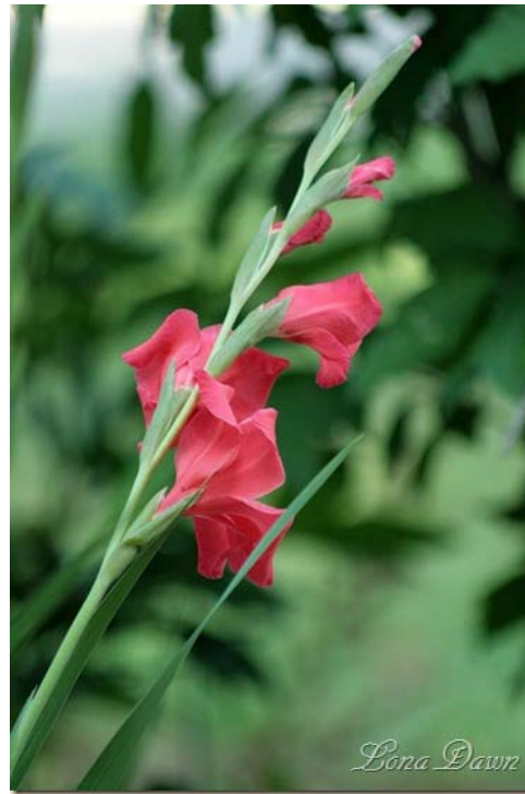
This Gladiolus that just showed up one summer from out of the blue is pretty with its dark peach blooms. Free flowers are always welcome.