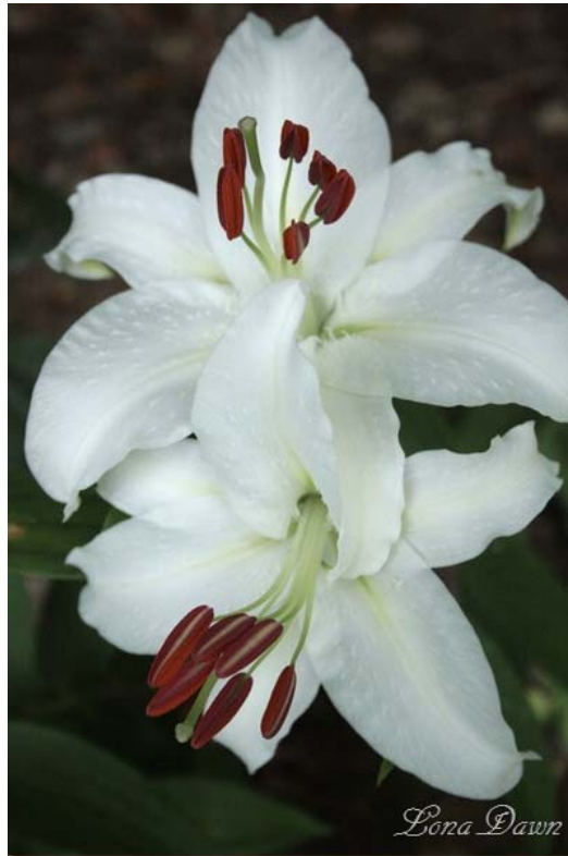
This white 'Snow Princess' lily is just so pretty. I love pure white blooms in the garden and this one has very large ones.