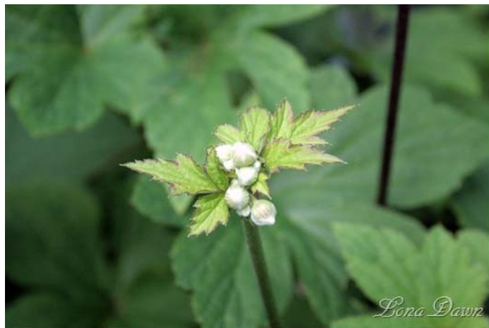
Anemone 'Queen Charlotte' is getting her buds for blooming.

Some flowers are waning in the garden from the heat and others are getting ready for fall blooms.