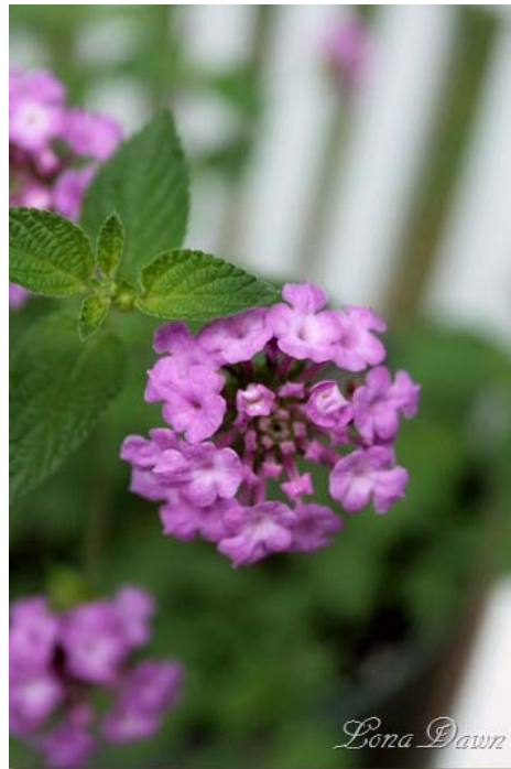
Lantana 'Luscious Purple' is new this summer. The bees, hummingbirds and butterflies love it.