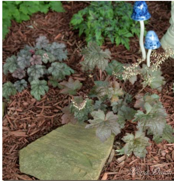
Heuchera 's 'Amethyst Mist' and 'Palace Purple' are blooming.

The Elephant Ear in the tub is still growing and putting on giant leaves. It likes the tub and its home along the woodland bed. The three new kittens from a dumped off cat has been playing with the leaves. They also like setting in my dahlia planters and anywhere else they can climb into. As if we needed more feral cats around here.