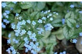
Brunnera Jack Frost