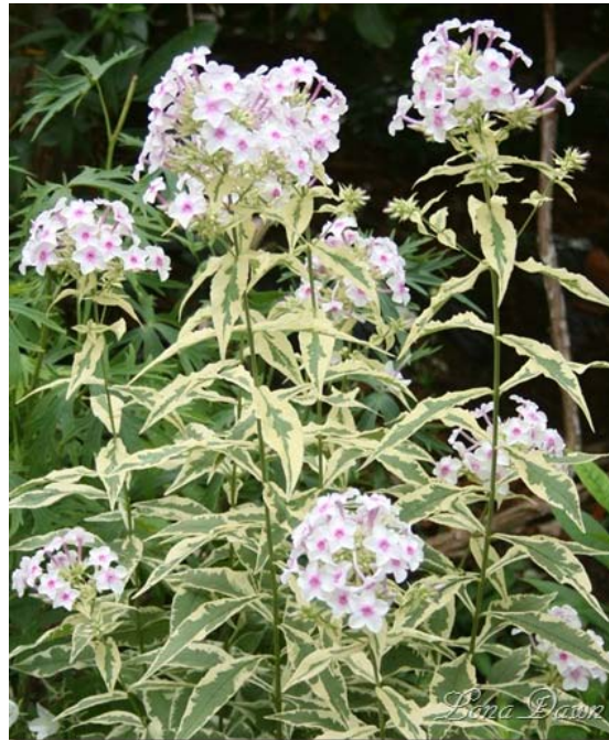
Tall Phlox 'Nora Leigh' is looking pretty now as the blooms unfold. The variegated foliage makes it a favorite of my phlox.