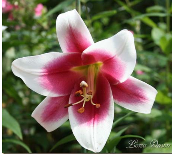
The new Asiatic Lily 'Frisco' that I got for half price is blooming.