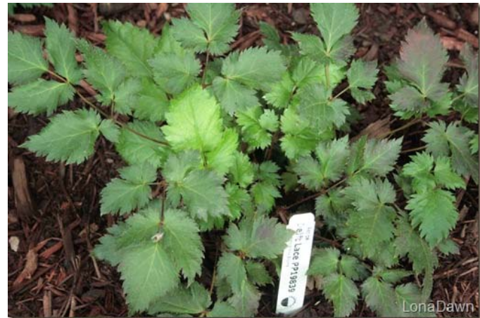
A new Astilbe 'Delft Lace' has been added to the shady flower bed. It is a compact astilbe with wonderful foliage and is suppose to have pink blooms in late spring. It was another half price bargain.