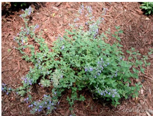
Nepeta 'Walkers Low' Catmint is still spreading and blooming.