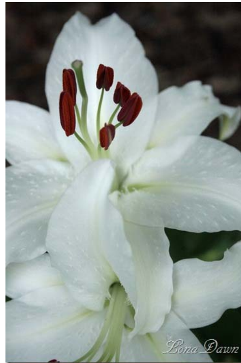
These will likely be the last of the lilies blooming this summer unless Stella de Oro has a few more.