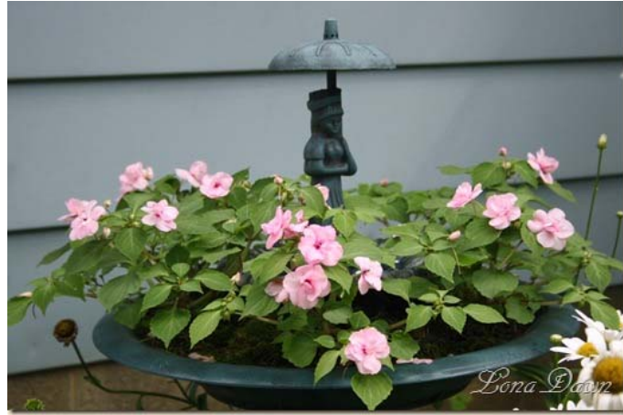
.....old birdbath. All of the water splashes out of this birdbath and it was leaking so it became a planter.