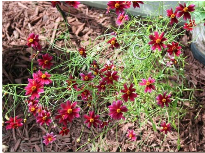
Coreopsis 'Limerock Ruby' has another flush of blooms since it was deadheaded.