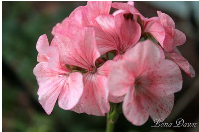
Pelargonium 'Raspberry Swirl' geranium has freckles.