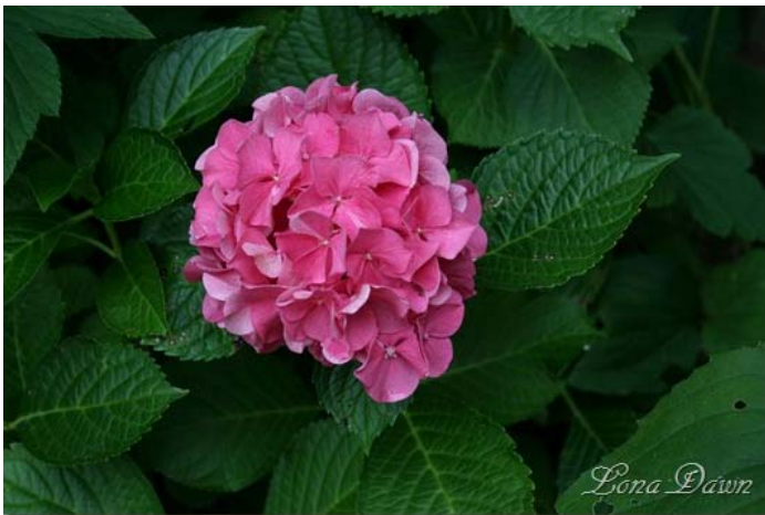
Hydrangea 'Alpen Glow' is still looking pretty.